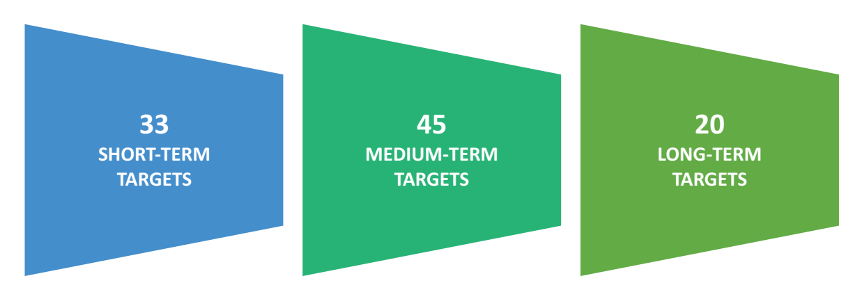
Figure 7: Categorising the SDG Targets in the AJ&K

In the AJ&K, Target 6.1 i.e. "By 2030, achieve universal and equitable access to safe and affordable drinking water for all" was considered the most important aspect to address. This signifies that availability of water as well as its safe consumption are major concerns in the State. On the other hand, Target 16.2 i.e., "End abuse, exploitation, trafficking and all forms of violence against and torture of children" was categorised as a long-term target. The findings from district consultations indicate that efforts must be made to increase awareness, change mindsets, and encourage reporting of such cases which require continuous support.