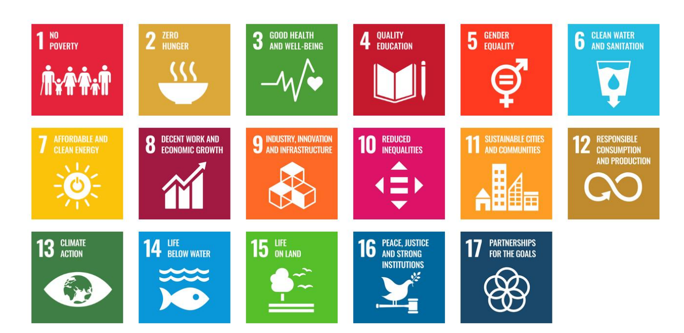
Figure 1: The Sustainable Development Goals (SDGs)

Pakistan adopted the SDGs in September 2015 and the National Assembly of Pakistan unanimously declared SDGs as the country's national development agenda on the 16<sup>th</sup> February 2016. The Parliamentary SDGs Secretariat was also established as an oversight and monitoring institution. Following this, national and sub-national SDG Support Units were established in the country, including the Azad Jammu & Kashmir (AJ&K) and Gilgit-Baltistan (GB).